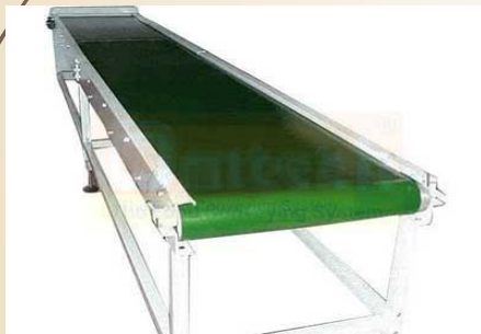
Aluminum Conveyor System