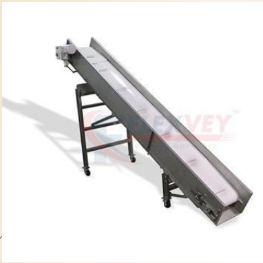
Steep Incline Conveyor