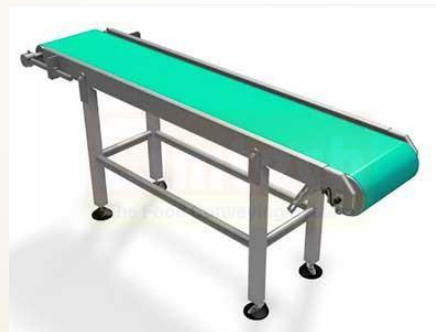
Straight Belt Conveyors