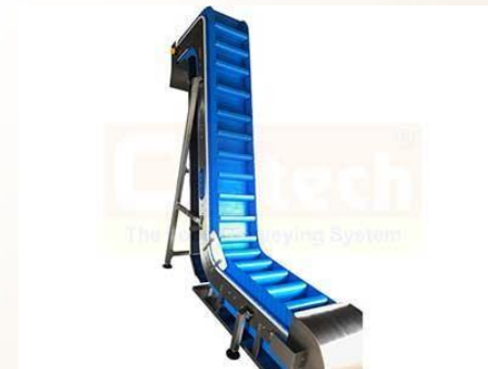
Inclined Belt Conveyor