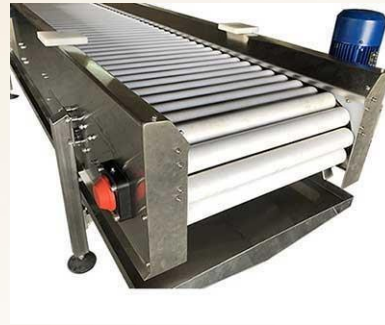
Gravity Roller Conveyor System