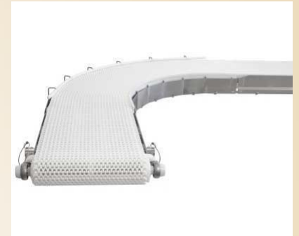
Plastic Chain Belt Conveyor System