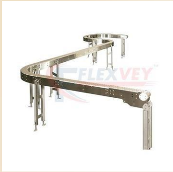
Stainless Steel Conveyor System