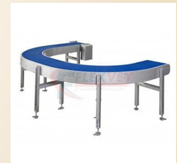
Curved Belt Conveyor