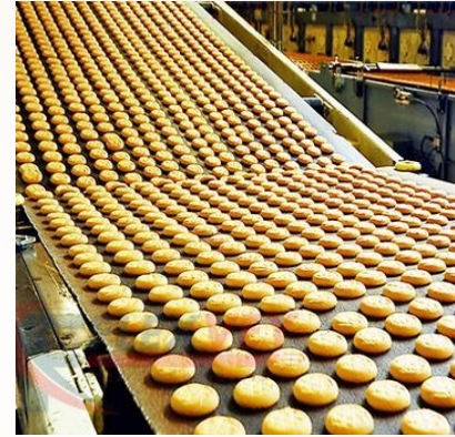
Food Conveyor Belt